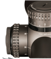
Push in to lock.