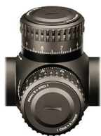
MRAD Models "1 Click = 0.1 MRAD"