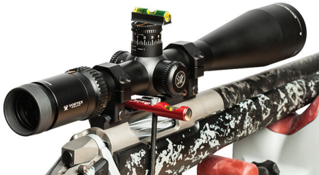
Using bubble levels to square the riflescope to the base.

Note: After aligning the reticle, tighten and torque the ring screws down. Vortex® Optics recommends a torque setting of 15-18 in/lbs on the ring screws.