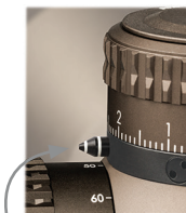
Turret in third turn of rotation (fully extended).

Note: Some combinations of rifle, base and rings may not allow a second or third rotation of the elevation turret.