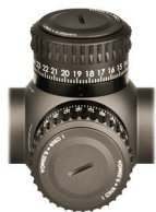
MOA Models "1 Click = 0.25 MOA"

Depending on which version you have purchased, your Razor® HD Gen II riflescope will feature adjustments and reticles scaled in MOAs or MRADs. Both minute-of-angle (MOA) and milliradian (MRAD) unit of arc scales are equally effective when ranging or adjusting riflescope for bullet trajectory.