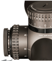
Pull out to unlock and adjust.

To activate the illumination, pull out the dial and adjust by rotating the adjustment dial in either direction. The illumination dial allows for 11 levels of brightness intensity; an off click between each level allows the shooter to turn the illumination off and return to a favored intensity level with just one click.