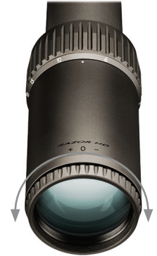
Adjust the reticle focus.

WARNING: Looking directly at the sun through a riflescope, or any optical instrument, can cause severe and permanent damage to your eyesight.