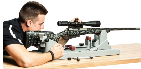
Visually bore-sighting a rifle.