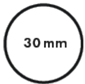
Main tube 30 mm