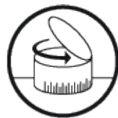
Ballistic Drop Compensation (optional)